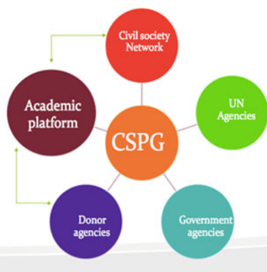
Fig. 2. (Colour online) Partners of Ghana's scaling up nutrition Cross-sectoral Planning Group on Nutrition (CSPG).

would therefore be done in a phased manner. At the country level, inter-university platforms would be initiated to discuss formulation and adoption of universal core set of competencies and curricula for the nutrition professionals. Aside pedagogic firewalls, challenges relating to resources and linguistic diversity are real, and ought to be addressed. As a member of the SUN MSP, the AP is in a position to act as a facilitator, between relevant higher education institutions in the continent on these matters.